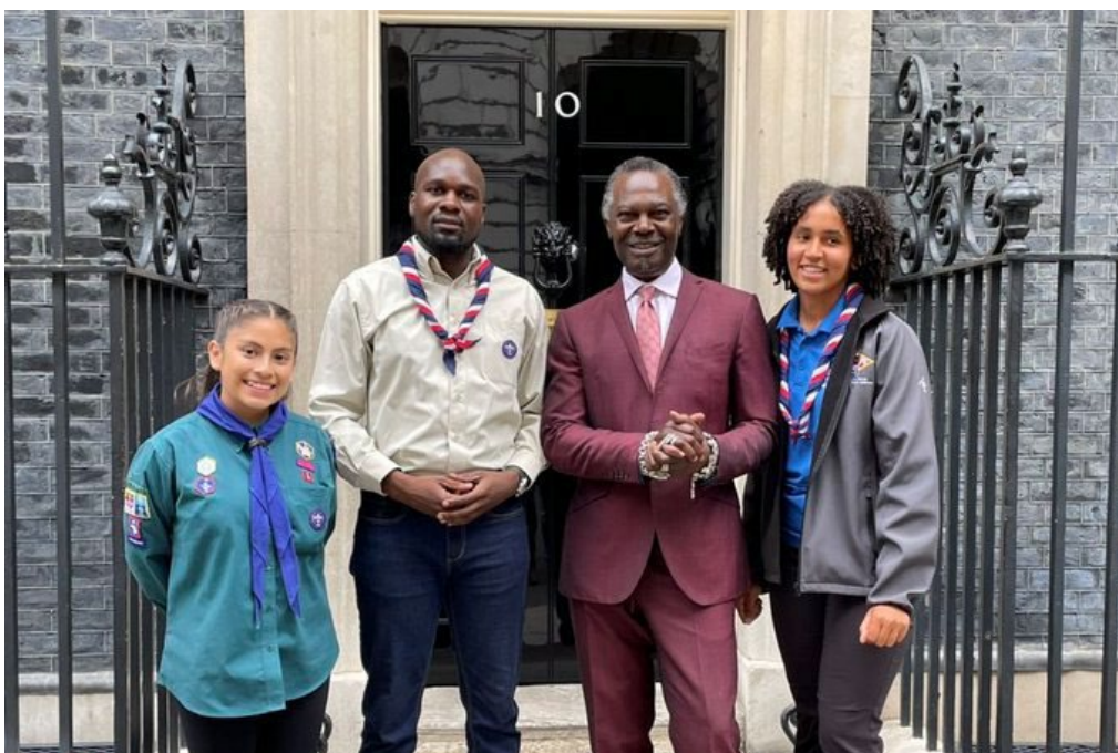
Chief Scout, Dwayne Fields, Polar Explorer & TV Presenter (second from left) with celebrity chef Levi Roots (third from left) with our Scouts at 10 Downing Street, London UK