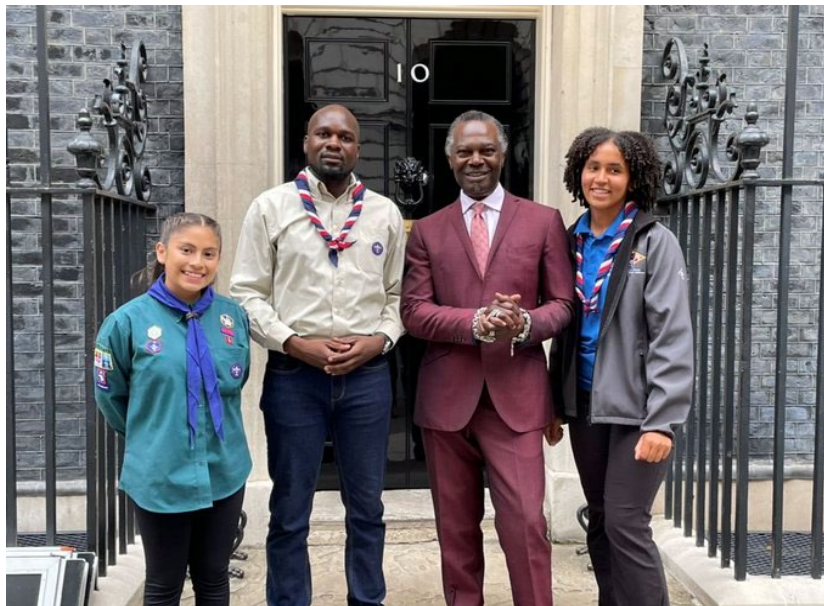
Chief Scout, polar explorer and TV presenter, Dwayne Fields, (second from left) with celebrity chef Levi Roots (third from left) with our Scouts at 10 Downing Street, London.