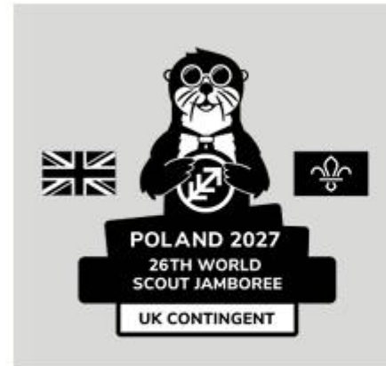
Simplified logo in black and white