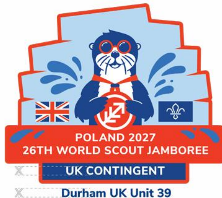
Personalised logo, maximum group name height to match the X height of 'UK Contingent'