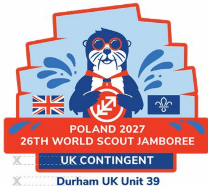
Personalised logo with group name

The size of the regional text should be the same size as the words 'UK Contingent'. Using the font Nutino Sans, in the weight Black. The colour of the font should be Scout Navy or White, depending on the colour of the merchandise.