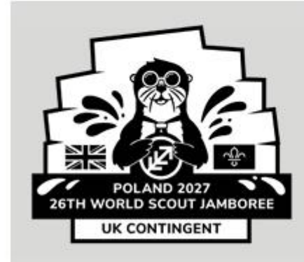
Primary logo in black and white