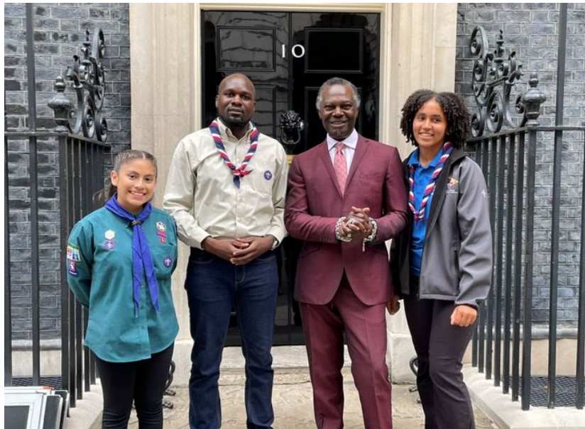
Chief Scout, polar explorer and TV presenter, Dwayne Fields, (second from left) with celebrity chef Levi Roots (third from left) with our Scouts at 10 Downing Street, London.