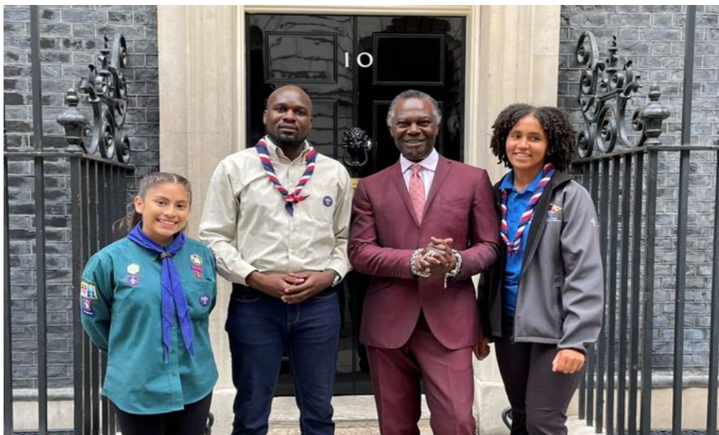
Chief Scout, polar explorer and TV presenter, Dwayne Fields, (second from left) with celebrity chef Levi Roots (third from left) with our Scouts at 10 Downing Street, London.