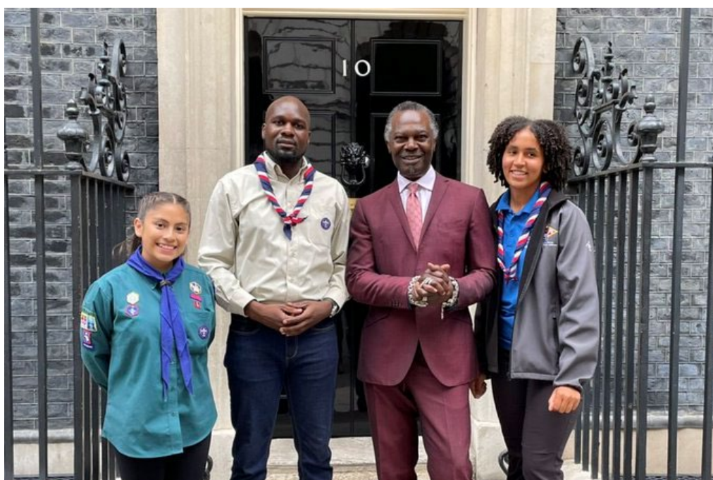
Chief Scout, Dwayne Fields, Polar Explorer & TV Presenter (second from left) with celebrity chef Levi Roots (third from left) with our Scouts at 10 Downing Street, London UK