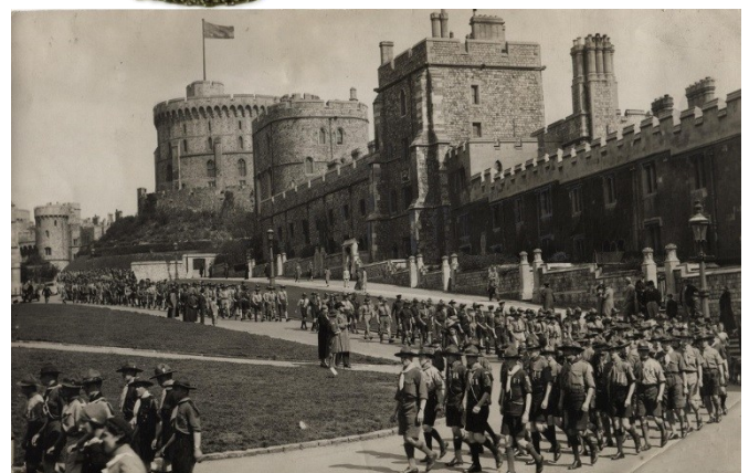
Scouts taking part in the first King's Scout Parade at Windsor Castle.