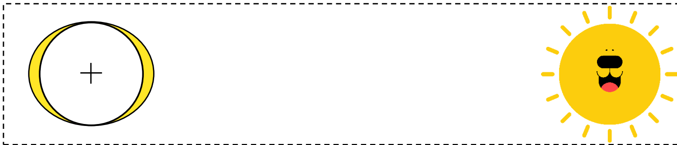
Tidal effect of the sun