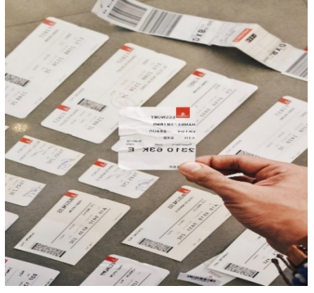
Your holiday ticket