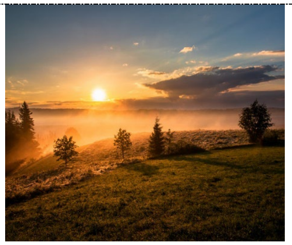
A beautiful landscape