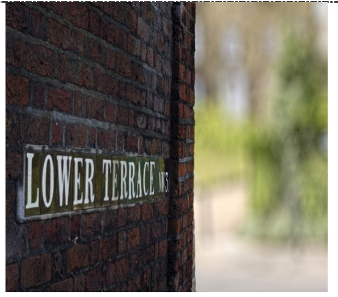
Your road name