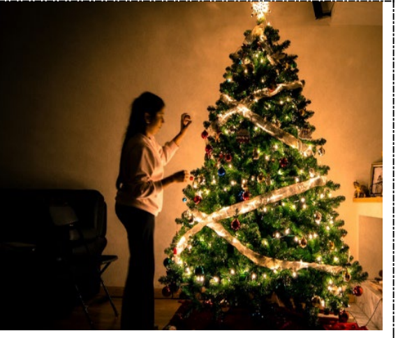
A Christmas tree or festive symbol