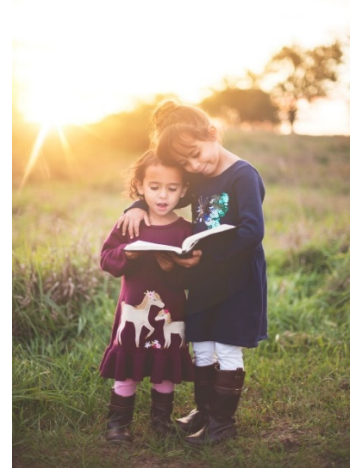
A photo of you and your little sister