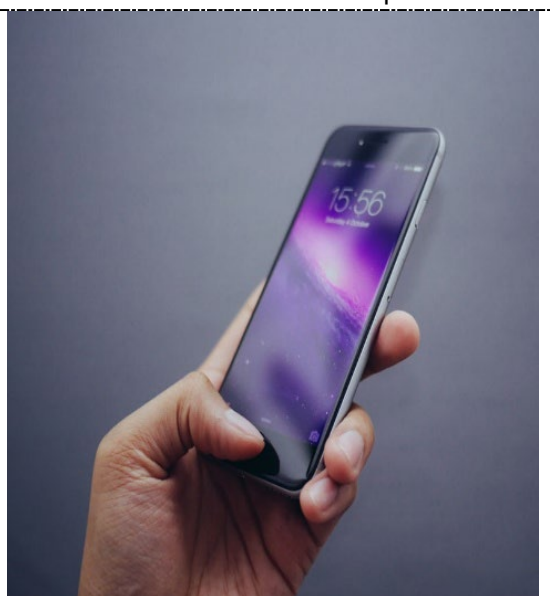
Your phone or phone number

Throwing a party Saturday. 10pm @7 Oak Rd, Anytown