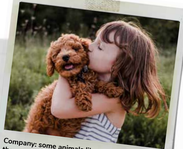
Company: some animals like it more than others...

1 Ask your young people if they have ever helped to look after an animal and what they think animals need to be healthy and happy.