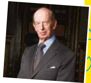
HRH The Duke of Kent, President of The Scouts and Honorary Chair of the Gilwell Fellows