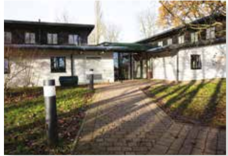
Peter Harrison lodge

The Jack Petchey Lodge and the Peter Harrison Lodge were built following two generous supporters donating over GBP 1,000,000 each. These incredible contributions towards the Fund have enabled us to provide a home for Scouts from all over the world, as well as for adults undertaking leadership programmes.