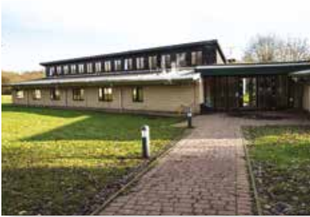
Jack Petchey lodge

Our International Volunteer Lodge provides 45 state-of-the-art rooms for our volunteer staff from all over the world. It's an outstanding example of the benefits of the Gilwell Development Fund.