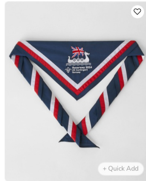
Roverway 2024 Scarf