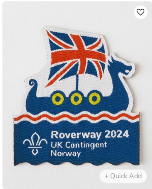
Roverway 2024 Badge