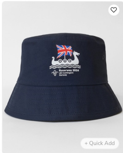
Roverway 2024 Bucket Hat