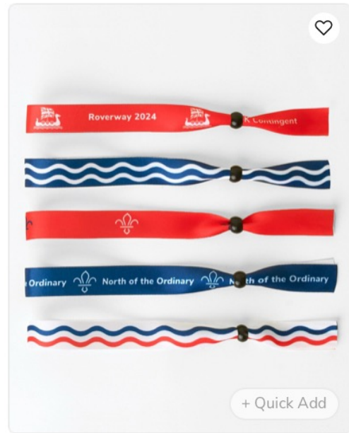
Roverway 2024 Pack of 5 Friendship Ribbons